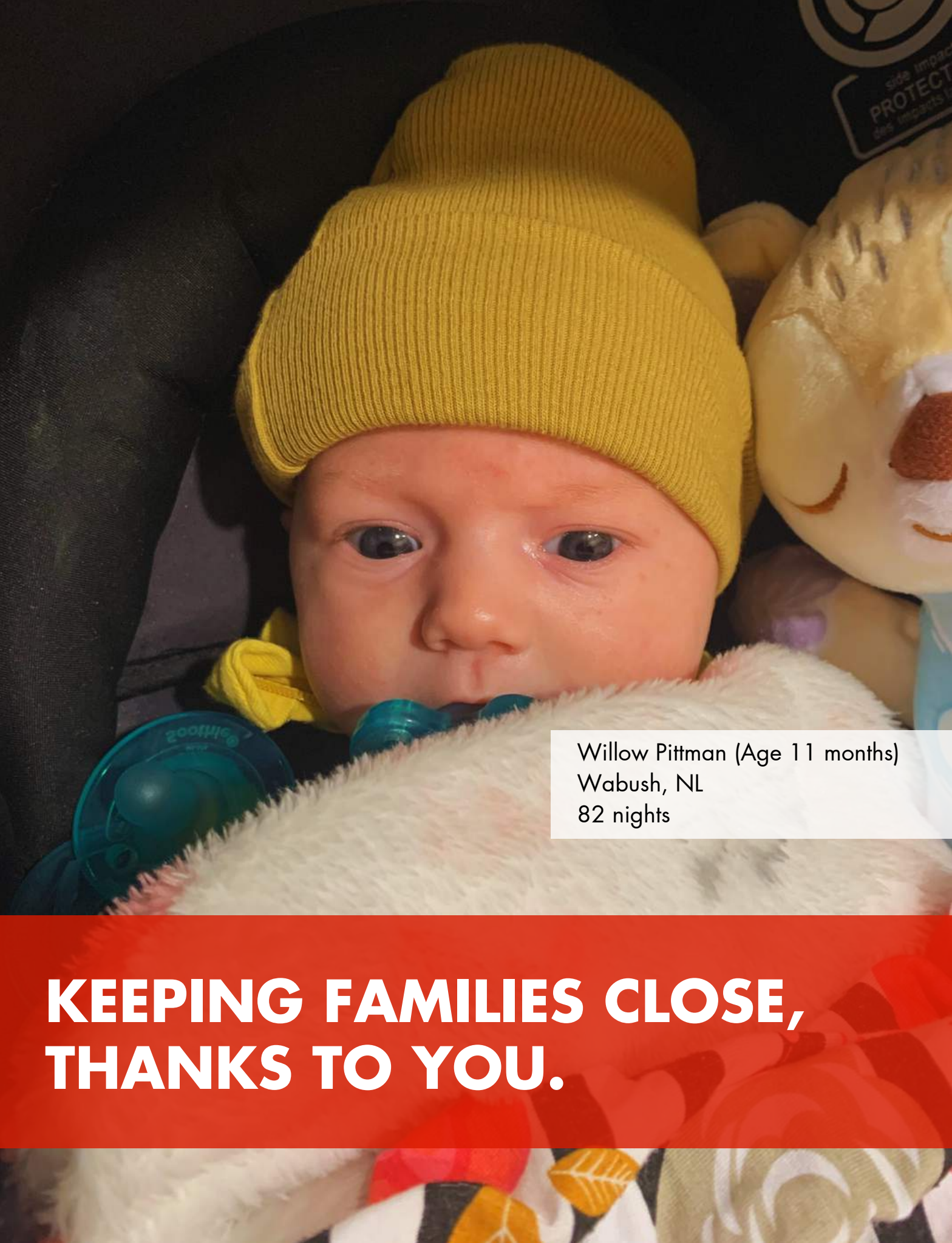
Willow Pittman (Age 11 months) Wabush, NL 82 nights