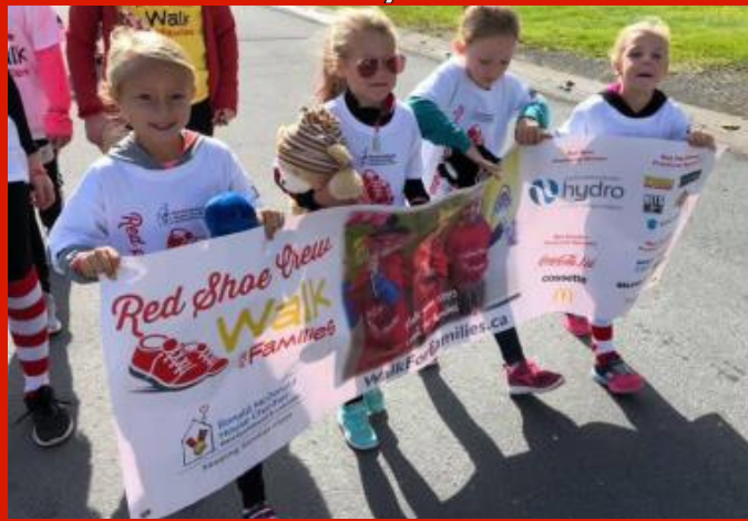
Red Shoe Crew-Walk for Families held annually in September