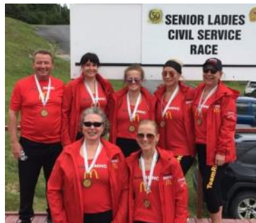
2021 Placentia Regatta