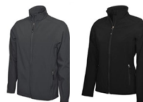
Black or Graphite

And receive an embroidered Ronald McDonald House Jacket