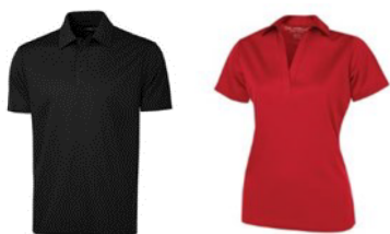
Black, Red or White

And receive an embroidered Ronald McDonald House POLO SHIRT (Mens or Ladies)