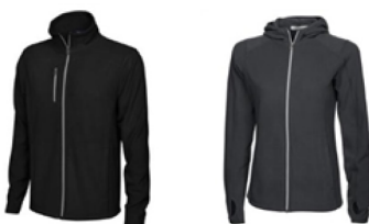
Black, Red or Graphite

And receive an embroidered Ronald McDonald House Fleece (Mens or Ladies)