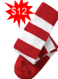
Signature Stripped Socks