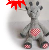
2022 "Gem" The Giraffe