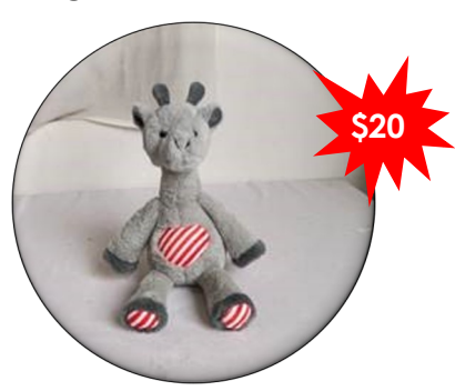
Gem the Giraffe- 1st in the Limited Edition RMHC NL Plush Collection