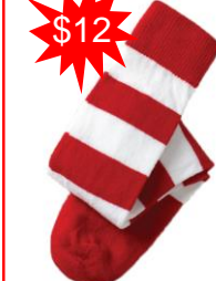
Signature Stripped Socks