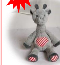
2022 "Gem" The Giraffe