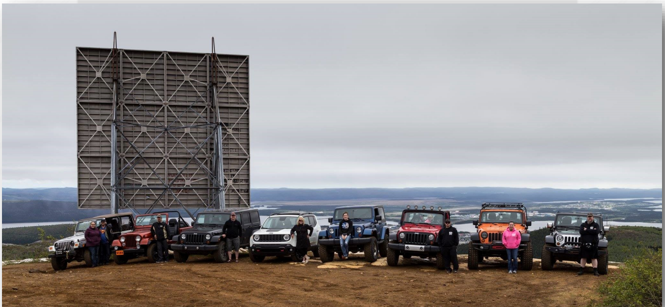
Go Topless - Labrador Jeep Owners