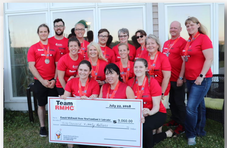
Team RMHC - Tely 10