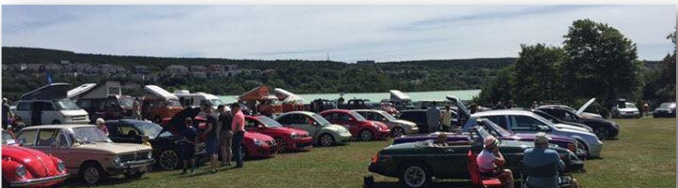
The Dub Show

It's important to thank everyone who helped make your fundraiser a success. Without them it wouldn't be possible.