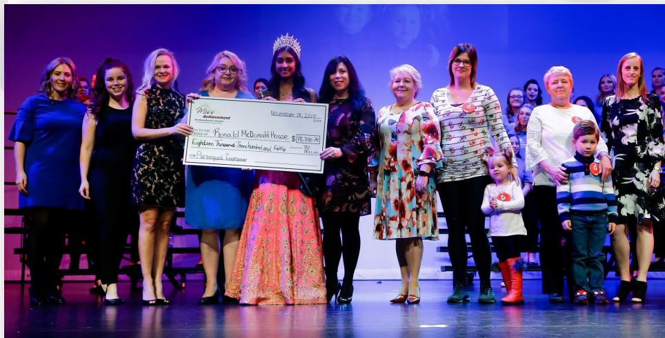
Miss Achievement Newfoundland and Labrador Scholarship Program

Remember, fundraising activities are all sizes. Every donation makes a difference in the lives of sick children and their families staying at Ronald McDonald House Newfoundland and Labrador.