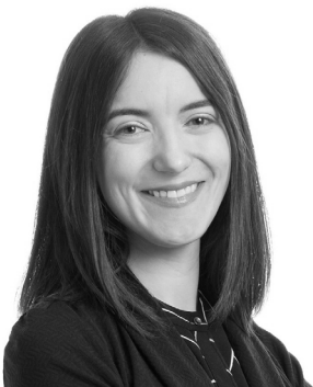
Treasurer Ronald McDonald House Charities Newfoundland and Labrador

I'm pleased to report that RMHC NL was fortunate enough to be able to continue to count on the generosity and support of thousands of donors, including individuals, community groups, service organizations, labour organizations, businesses, charities and government. This support takes the form of financial contributions, in-kind contributions of goods and services, participation in a wide variety of fundraising events and countless volunteer hours. We certainly are very honoured to have this level of support especially in a year where many were facing their own new challenges.