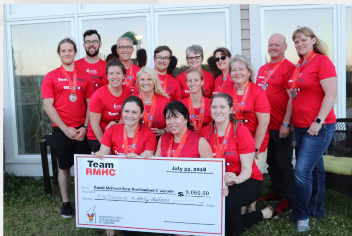
Team RMHC - Tely 10