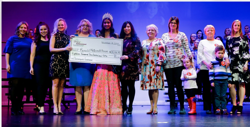
Miss Achievement Newfoundland and Labrador Scholarship Program

Remember, fundraising activities are all sizes. Every donation makes a difference in the lives of sick children and their families staying at Ronald McDonald House Newfoundland and Labrador.