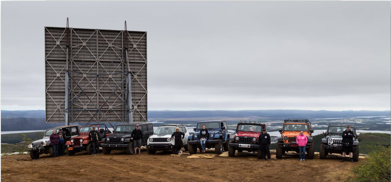
Go Topless - Labrador Jeep Owners