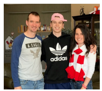
The Skinner Family of Massey Drive, NL 278 nights over 5 stays in 1 year