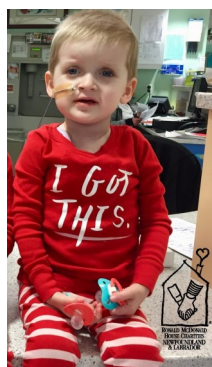
The Short Family of Deer Lake