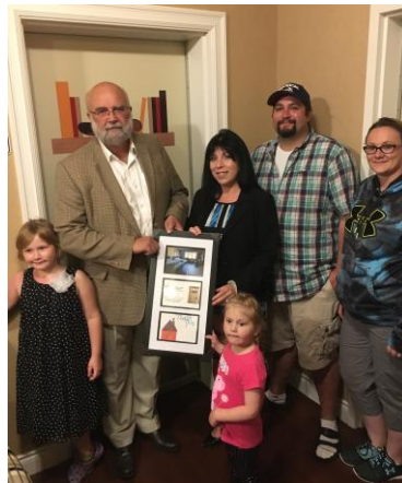
Newfoundland and Labrador Hydro